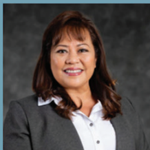
Senator Celina Roberto Babauta Senate Legislative Secretary Saipan