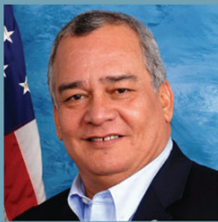
U.S. Congressman Gregorio Kilili Camacho Sablan Northern Mariana Islands Delegate to the U.S. House of Representatives