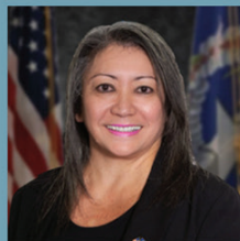
Senator Edith Deleon Guerrero Senate President Saipan