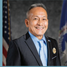
Rep. Vicente C. Camacho Precinct 3