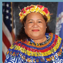
Rep. Denita K. Yangetmai Association of Pacific Island Legislatures (APIL) Representative Precinct 3