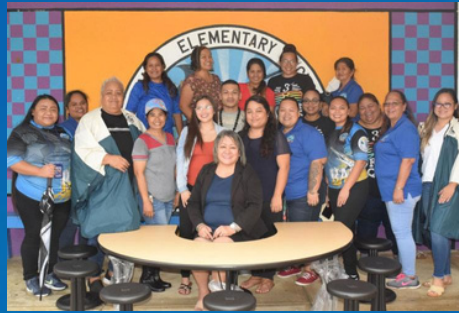
Kagman Elementary School - Horseshoe Tables & Wobble Chairs (October)