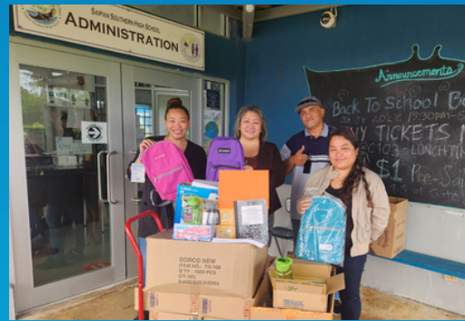
Saipan Southern High School - School Supplies (October)