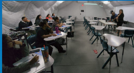
University of Guam Masters in Policies Admin. Cohort (October)